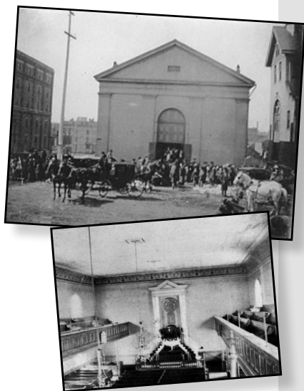
Grace Lutheran Church in downtown Milwaukee was constructed in 1851. Incorporated in 1849, Grace was where three Lutheran pastors met to discuss founding a synod that would eventually be known as WELS.

The very first resolution in the synod’s history, made at the Dec. 8, 1849, meeting, stated: “That the synod which is to be founded bear the name ‘The First German Evangelical Lutheran Synod of Wisconsin’ and that this