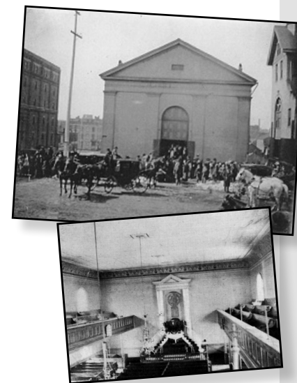
Grace Lutheran Church in downtown Milwaukee was constructed in 1851. Incorporated in 1849, Grace was where three Lutheran pastors met to discuss founding a synod that would eventually be known as WELS.

The very first resolution in the synod’s history, made at the Dec. 8, 1849, meeting, stated: “That the synod which is to be founded bear the name ‘The First German Evangelical Lutheran Synod of Wisconsin’ and that this